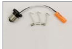
EGRF-RET04 For use in converting 4 in. round ceiling cans