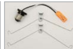
EGRF-RET06 For use in converting 6 in. round ceiling cans