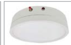
EGRF-BB08 Battery back-up (8 in. model only) (white only)