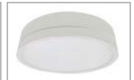
EGRF-BB08 PAM Spacing Pan (8 in. model only)