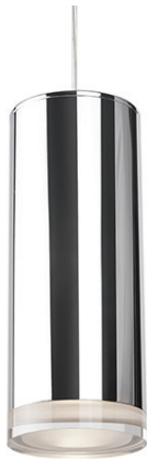
CH - Chrome