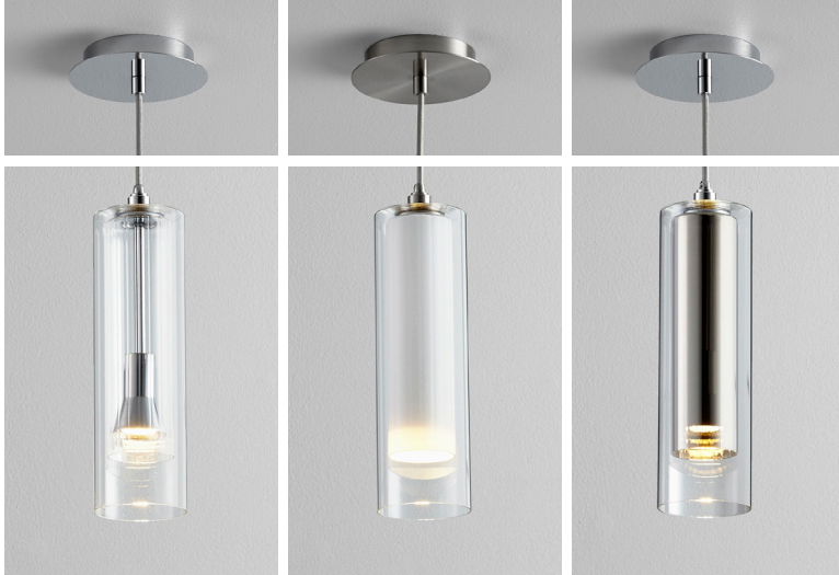
-14 Clear-Clear Glass/ Polished Chrome -124 Clear-Satin Opal Glass/ Satin Nickel -1414 Clear-Mirrored Glass/ Polished Chrome

FIXTURE TYPE _____ LOCATION _____ PROJECT _____ DATE _____