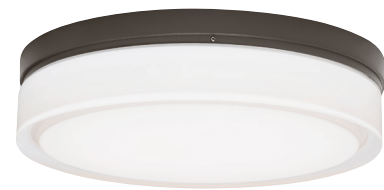
CIRQUE LARGE shown in bronze

* Visit techlighting.com for specific warranty limitations and details.