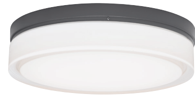
CIRQUE LARGE shown in charcoal